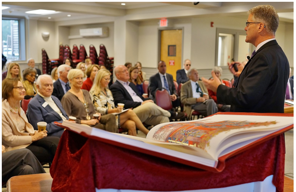
Pathways with The Saint John's Bible, October 2018