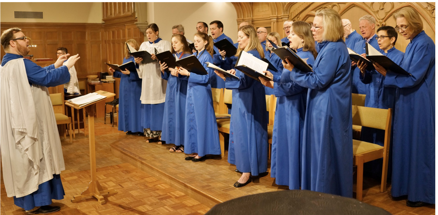
Evensong, April 2018