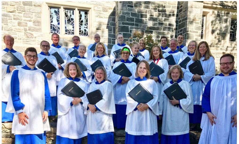
The Saint Luke's Parish Choir, September 2018