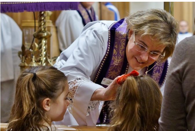
Communion, December 2018