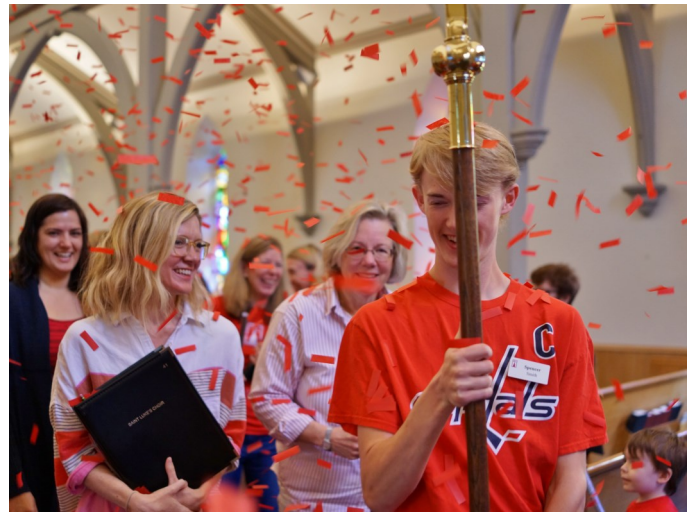
Pentecost Confetti, May 2018