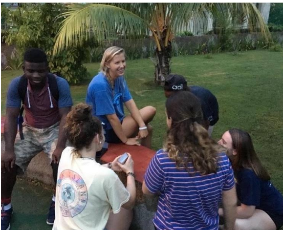
Youth Mission Trip to Cuba, July 2018