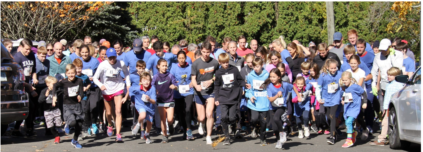
Run with the Saints, November 2018