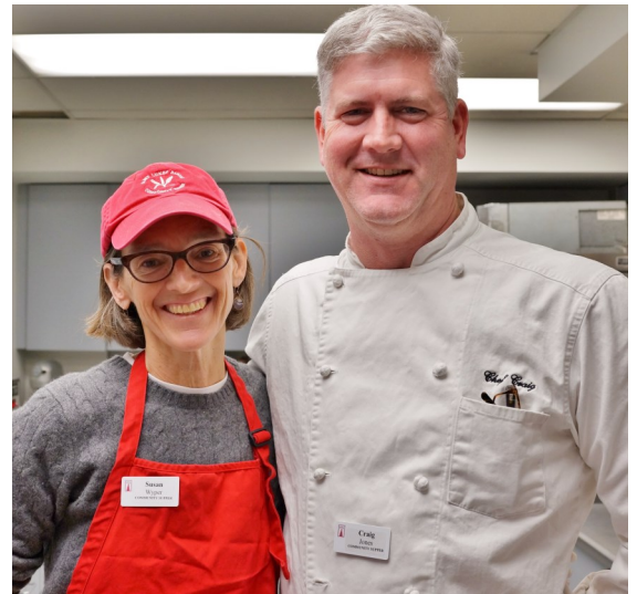
Community Suppers, February 2018