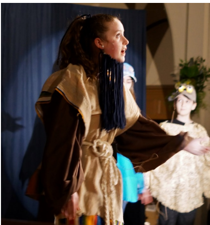
Jonah and the Whale—Easter Vigil, March 2018