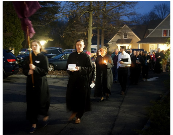
Maundy Thursday, March 2018