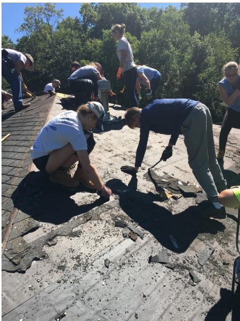
Senior Youth Mission Trip to Minnesota, July 2018