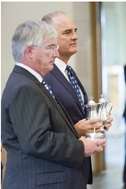
Ushers, June 2018