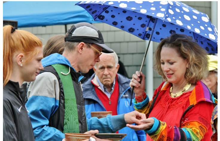
BBQ & Blues Kickoff, September 2018