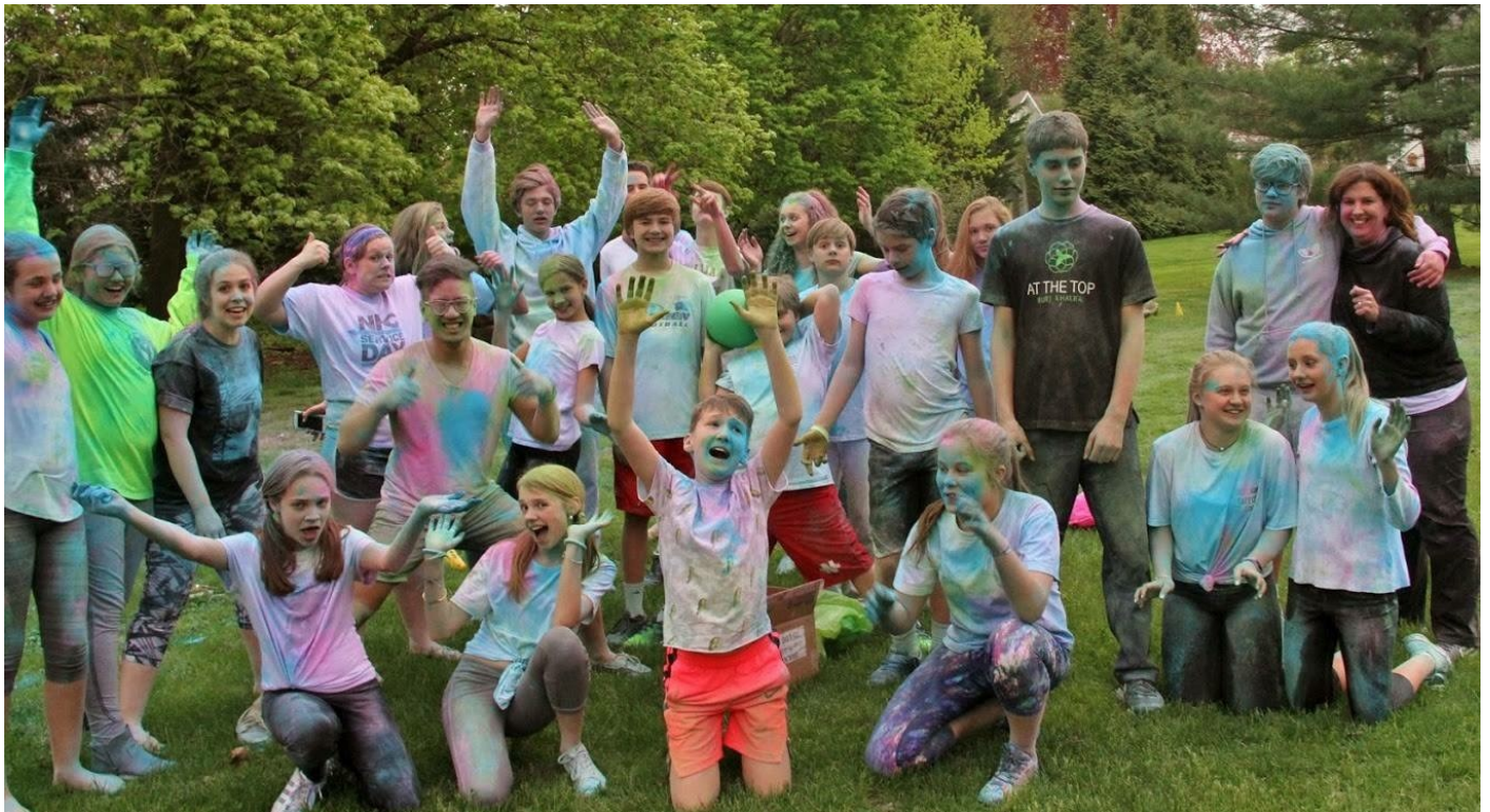
Youth Color War, May 2018