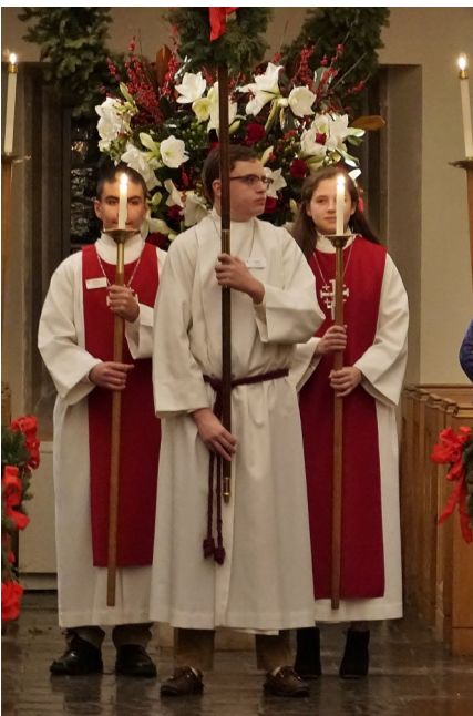
Acolytes, December 2018

On motion duly made and seconded, the Parish approved the minutes of the 2016 Annual Meeting.