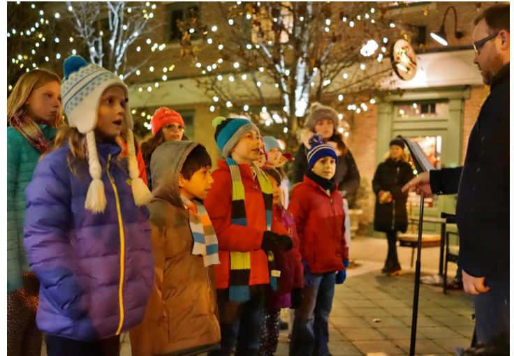
Caroling at Grove Plaza, December 2018