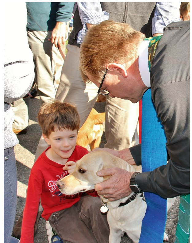
Blessing of the Animals, September 2018