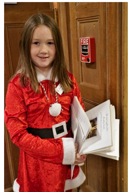
Christmas Eve Usher, 2018