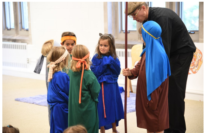
Saint Luke's Summer Camp, June 2018