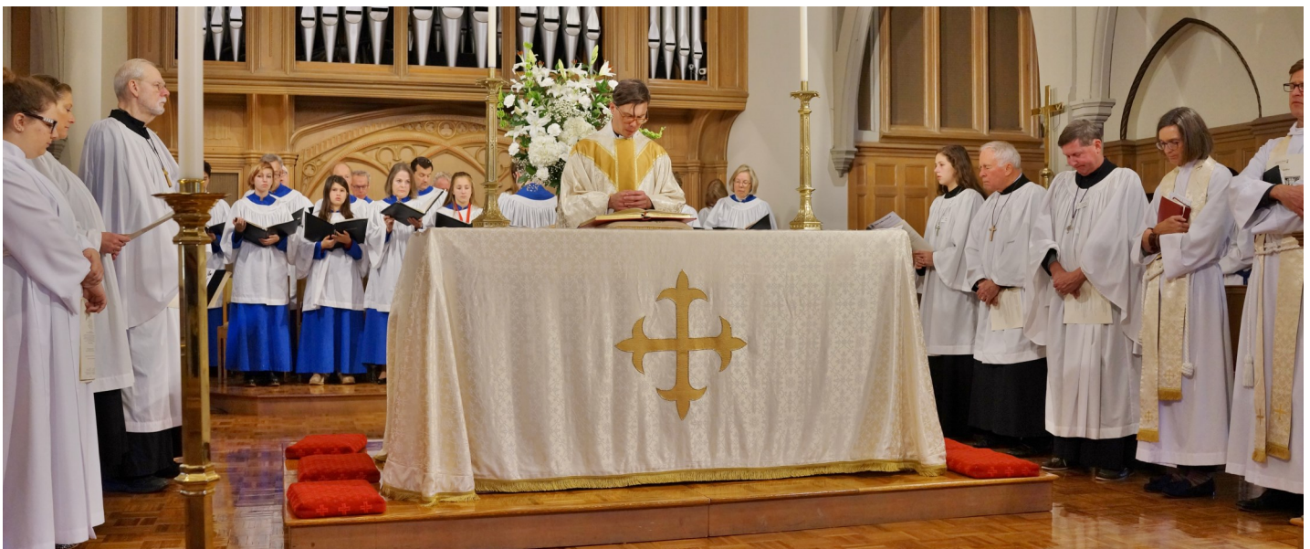
Remembrance Sunday, November 2018