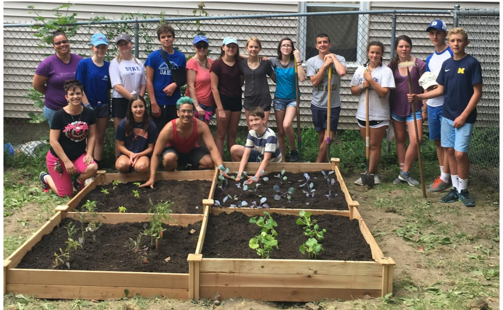
Youth Middler Mission Trip to Lewiston, Maine, July 2018