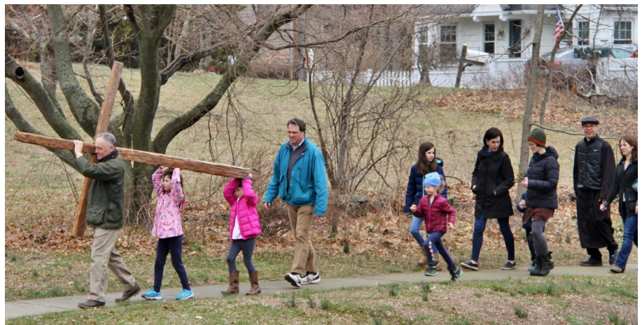
Procession of the Cross—Good Friday, March 2018